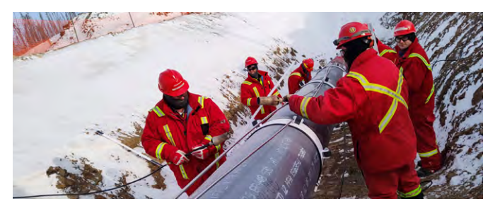
Fiber optic cables installation for the PLMS (pipeline leakage monitoring system) by Cameco

Our success in 2022 was realized in part from the strong relationships we continued to develop with external stakeholders, including the Alberta Energy Regulator (AER). To facilitate placing the newly constructed Long Lake to Kinosis Phase 1A (K1A) Boiler Feed Water (BFW) and Produced Emulsion pipelines into service, the project team, working together with all related departments, successfully received AER authorization for both in Q4. The receipt of these authorizations from the AER has been several years in the making and marks a significant milestone.