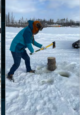
CNOOC representatives enjoying Anzac Winterfest