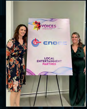
CNOOC representatives at Girls Inc. Women Of Inspiration